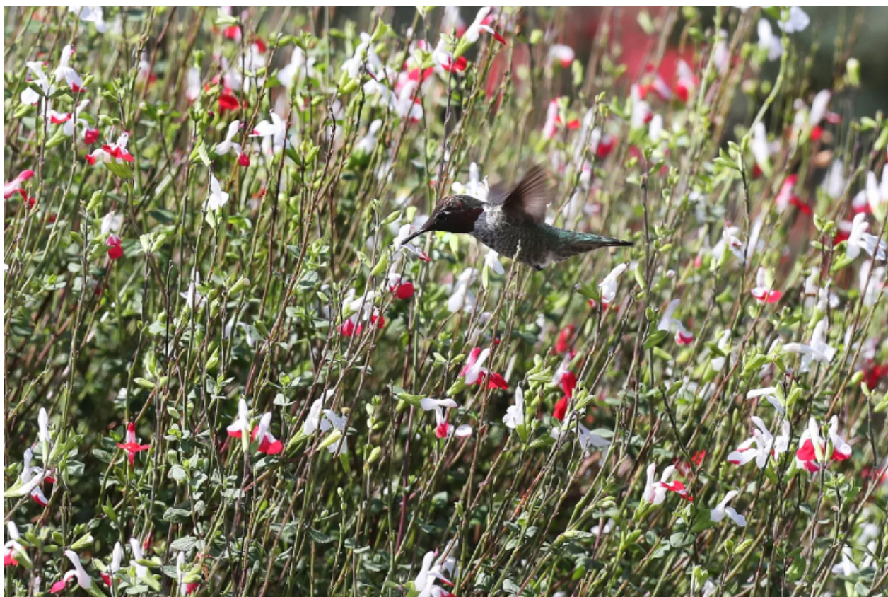
An Allen's hummingbird feeds on nectar at the Urban Forest on Wednesday.